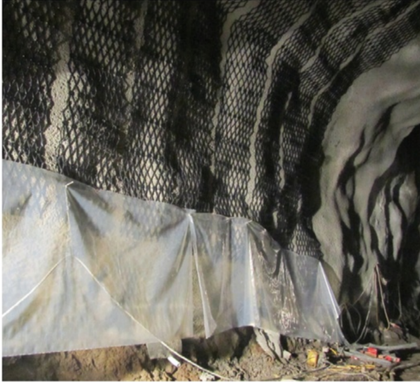
Rockdrain being installed on the concrete lining

A new drainage system, under development and trial for a decade, is now ready to be launched on the world. We take a peek at this novel solution.